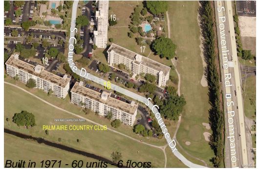
Built in 1971 - 60 units - 6 floors