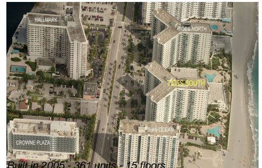
Built in 2005 - 361 units - 15 floors