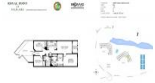
Architectural rendering of the building and surrounding area.