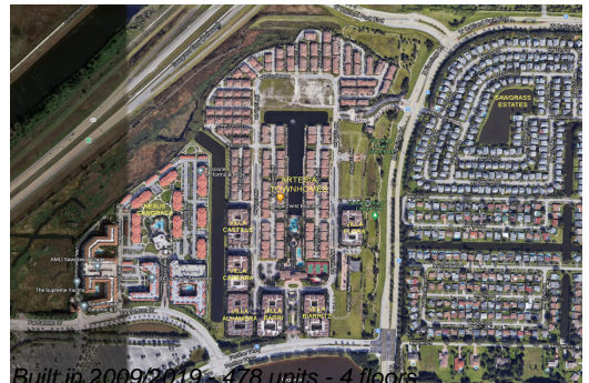
Built in 2009, 2019 - 478 units - 4 floors