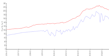
Hollybrook Golf & Tennis Club 1-22 vs Pembroke Pines