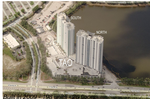
Built in 2009 - 198 units - 26 floors