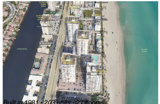
Built in 1981 - 203 units - 27 floors