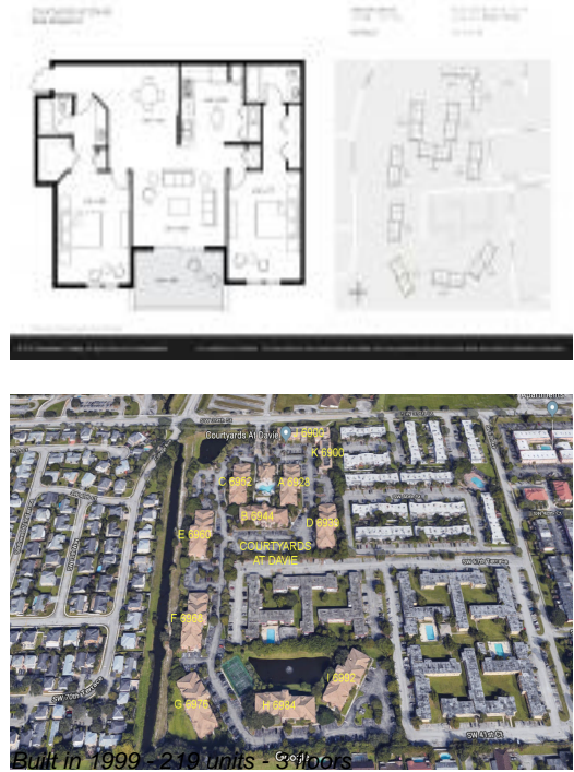
Built in 1999 - 219 units - 3 floors