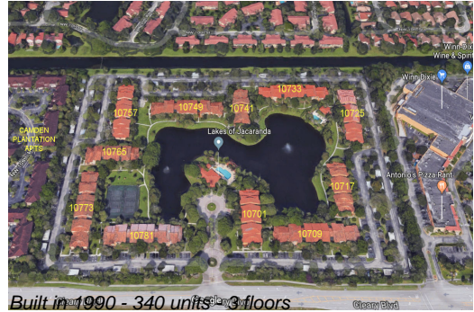
Built in 1990 - 340 units - 6 floors