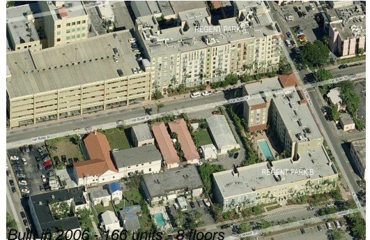
Building 2006 - 166 units - 8 floors