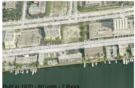
Built in 1970 - 80 units - 7 floors