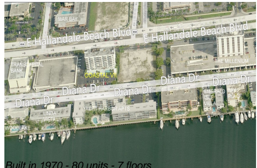
Built in 1970 - 80 units - 7 floors