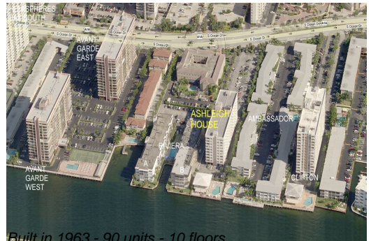
Built in 1963 - 90 units - 10 floors