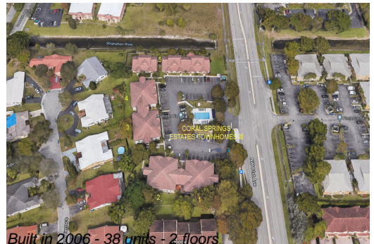
Built in 2006 - 38 units - 2 floors