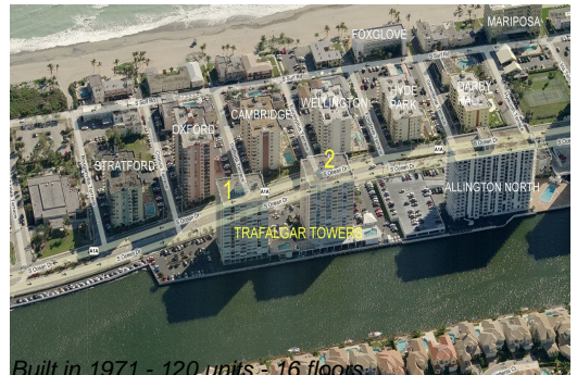
Built in 1971 - 120 units - 16 floors