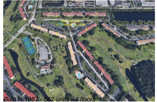
Built in 1987 - 552 units - 2 floors