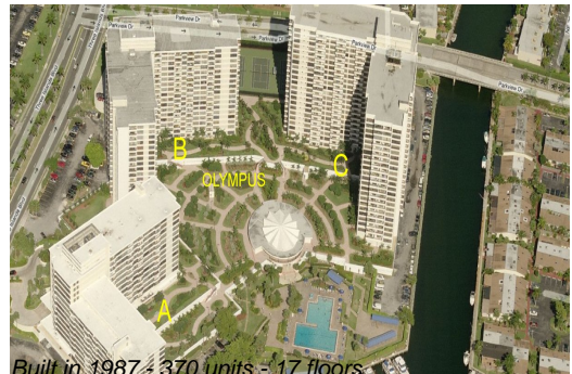
Built in 1987 / 370 units - 17 floors