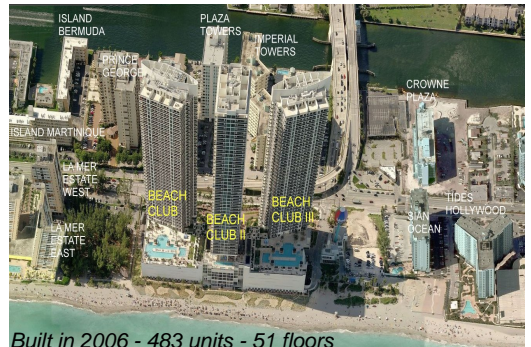
Built in 2006 - 483 units - 51 floors