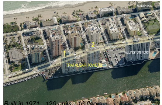
Built in 1971 - 120 units - 16 floors