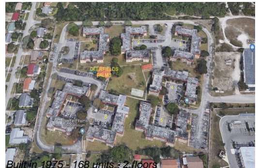
Built in 1975 - 168 units - 2 floors