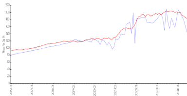
Granada Village (2001 to 2006) vs Coconut Creek