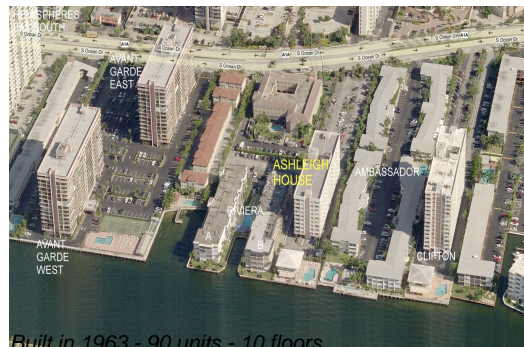
Built in 1963 - 90 units - 10 floors