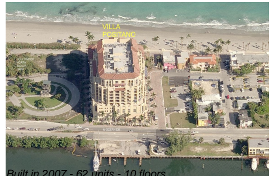
Built in 2007 - 62 units - 10 floors