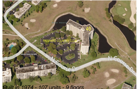
Built in 1974 - 107 units - 9 floors