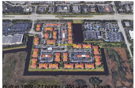
Built in 1999 - 21 blocks ~468 units - 3 floors