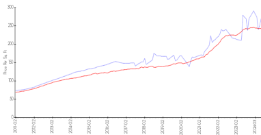
El Ad Poinciana vs Coral Springs