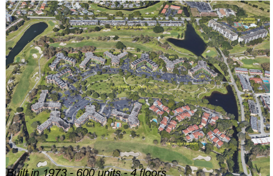
Built in 1973 - 600 units - 4 floors