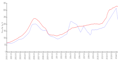
Isle of Paradise C vs Hallandale Beach