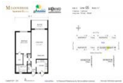
Built in 1973 - 56 units - 7 floors

505 - 901 NE 14 Av, Hallandale Beach, FL, Broward 33009