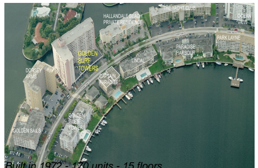
Built in 1972 - 170 units - 15 floors