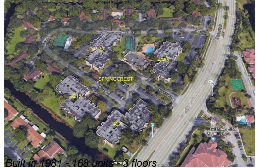
Built in 1981 - 168 units - 5 floors