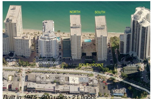
Built in 1975 - 200 units - 21 floors