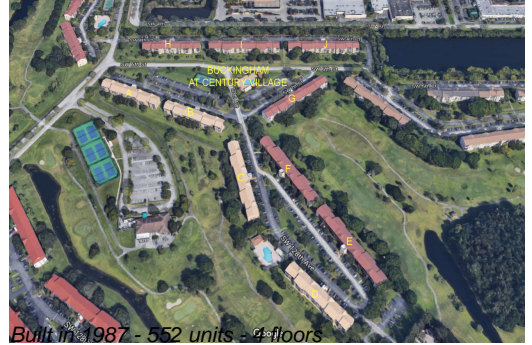
Built in 1987 - 552 units - 4 floors