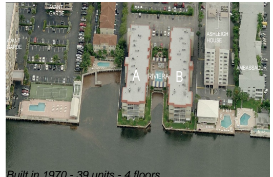
Built in 1970 - 39 units - 4 floors