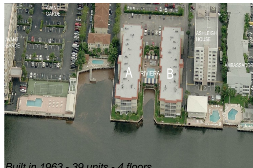
Built in 1963 - 39 units - 4 floors