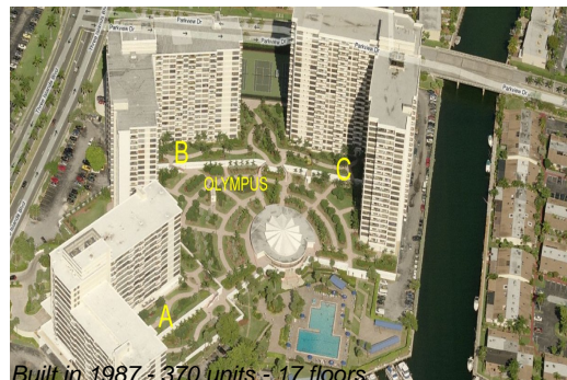
Built in 1987 / 370 units - 17 floors