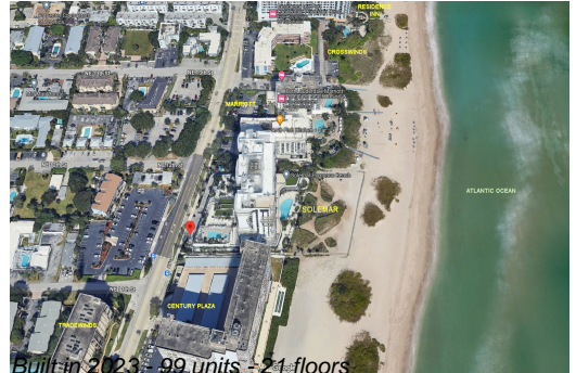
Built in 2023 - 99 units - 21 floors