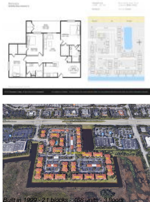
Built in 1999 - 21 blocks ~468 units - 3 floors

Marquesa (The) 33 days Pembroke Pines 56 days Broward 69 days