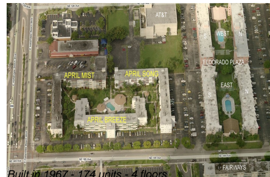
Built in 1967 - 174 units - 4 floors