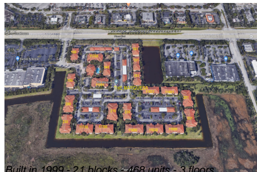
Built in 1999 - 21 blocks ~468 units - 3 floors