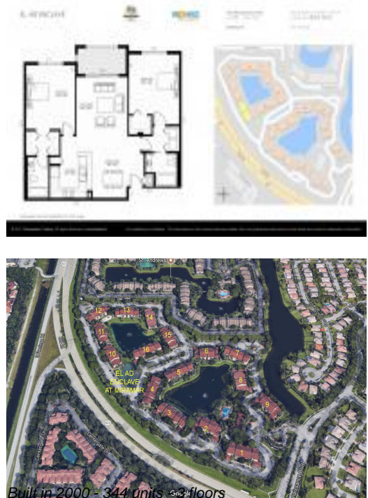
Built in 2000 - 344 units - 5 floors