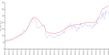
Golden Surf Towers vs Hallandale Beach

Golden Surf Towers: $250/sq. ft. Hallandale Beach: $328/sq. ft.