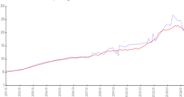
Garfield at Century Village (A-D) vs Pembroke Pines