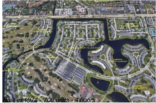
Built in 1974 - 708 units - 4 floors