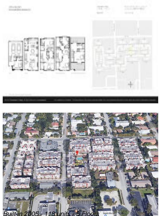
Built in 2005 - 118 units, 6 Floors

Villa Medici 6% Fort Lauderdale 5% Broward 4%