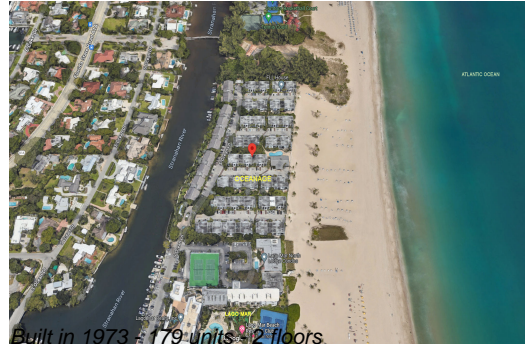
Built in 1973 - 179 units - 12 floors