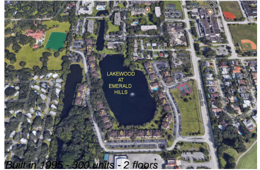
Built in 1995 - 300 units - 2 floors