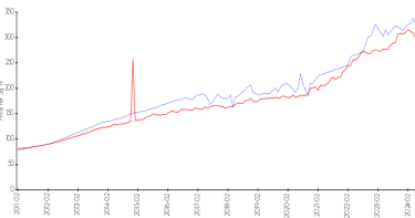
El Ad Enclave at Miramar vs Miramar