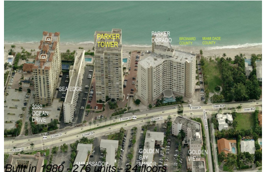
Built in 1980 - 276 units - 24 floors