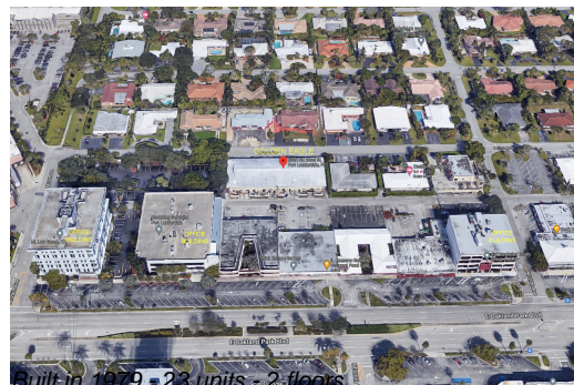
Built in 1979 - 23 units - 2 floors